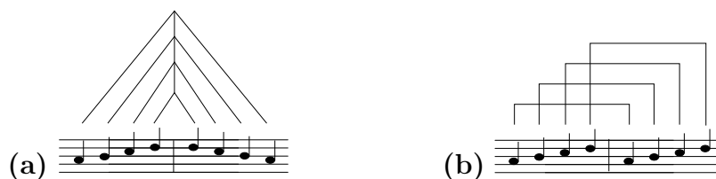
Figure 2: Context-free (a) and non-context-free (b) tone dependencies

Certain aspects of musical structure place musical languages at least in this category – an example is the “mirrored” melodic run in Figure 2(a).